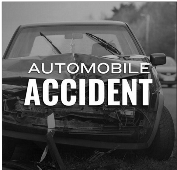
A crash injured 2 people in San Francisco.

Fire crews stabilized the truck while medics treated both injured individuals before transporting them to a hospital for further evaluation. Officials have not released additional details about the extent of the injuries, but responders