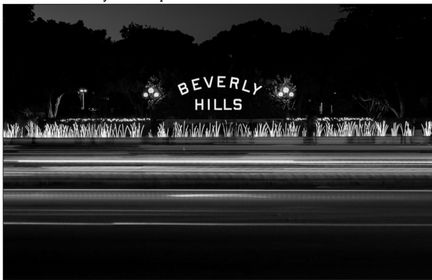
The city of Beverly Hills.